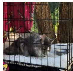
Furball aka Kitty