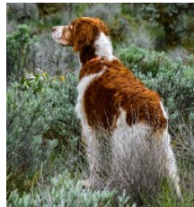
Murphy Whiteside 12/20/2006 – 10/25/2021