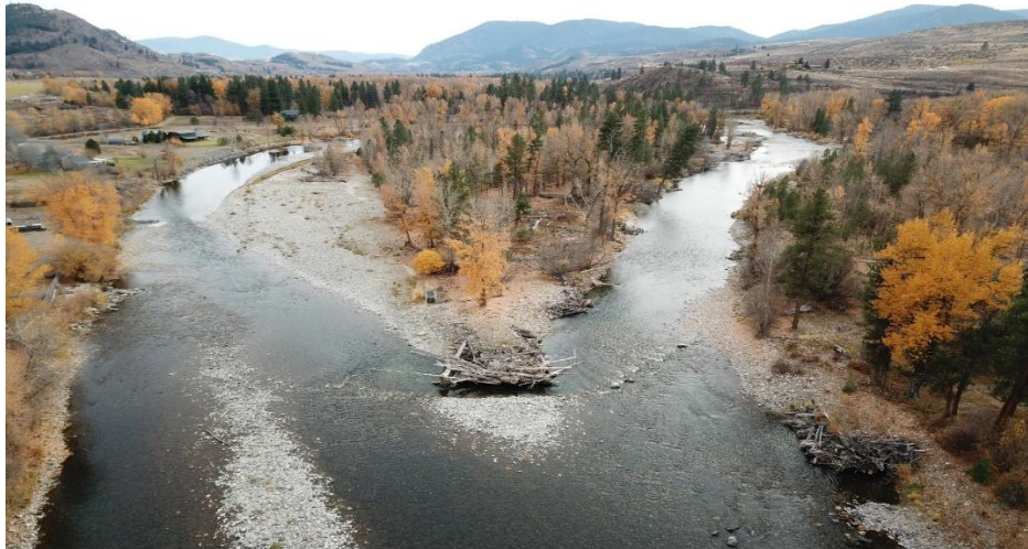
Methow Salmon Recovery Found., Sugar Reach Channel Reconnections Implementation (P22-1808) Attachment #529447, WDFW_Project_Area_Flow_sgrR.JPG

The Washington State Salmon Recovery Funding Board (SRFB) approved the Upper Columbia Region's 2022 project proposals in late-September with a collective project value of $2,942,241 ($2,239,901 went to Chelan County and $702,376 to Okanogan County). Funding was awarded to Cascade Fisheries, Methow Salmon Recovery Foundation, Yakama Nation, Cascadia Conservation District and Chelan County Natural Resources Department