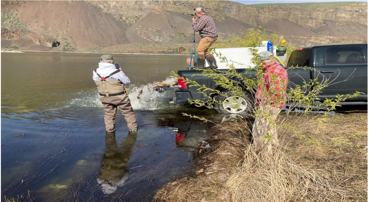
Releasing the trout from the fish tank to a different location on Lake Lenore

Due to the late notice, only two of us could help. The next day Gordy West and I drove out to the north end of Lake Lenore and met Mike, another WDFW biologist and two members of the Dryside Fly Fishing Club (Moses Lake). Together we netted and transferred approximately 950 Lahontan trout and transferred them to a truck with a large fish tank. The truck drove to mid-lake and released the trout. It took three trips to net, transfer and to release 950 fish.